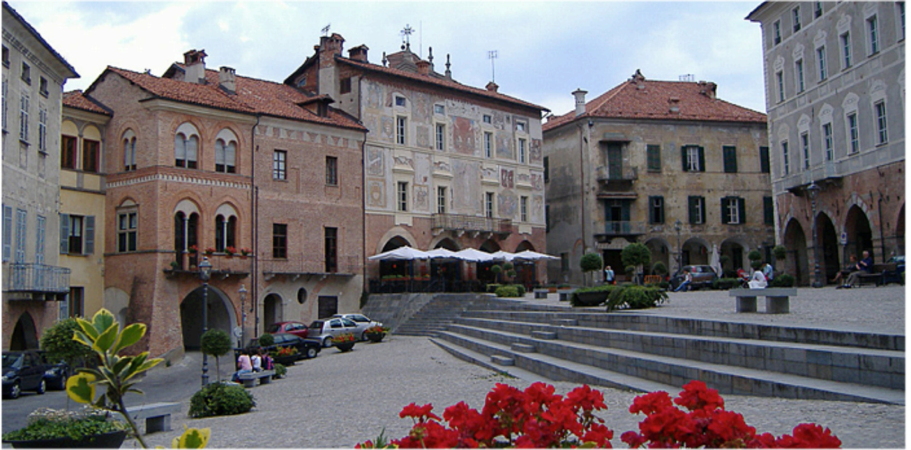
Mondovì (CN), Italy