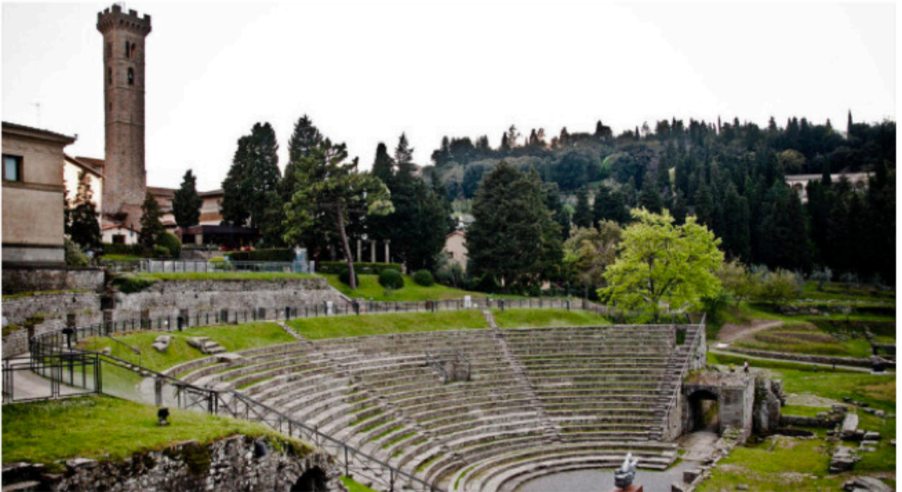
Fiesole (FI), Italy